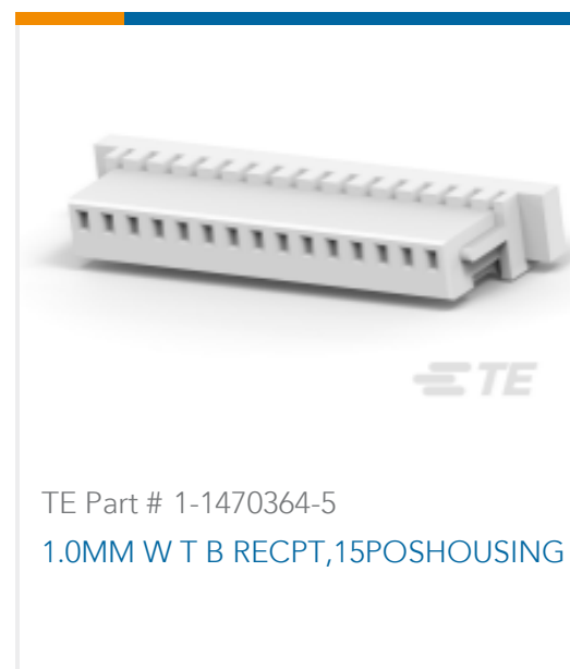
TE Part # 1-1470364-5 1.0MM W T B RECPT, 15 POS HOUSING