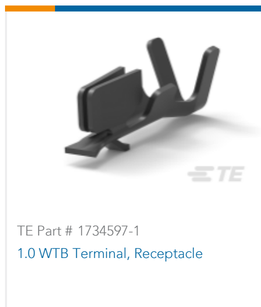
TE Part # 1734597-1 1.0 WTB Terminal, Receptacle